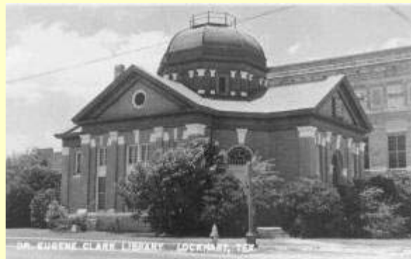
Dr. Eugene Clark Library in the 1950s