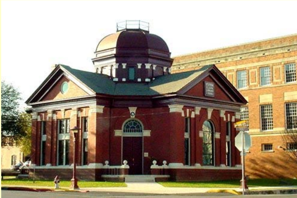
The recently restored Dr. Eugene Clark Library, circa 1899