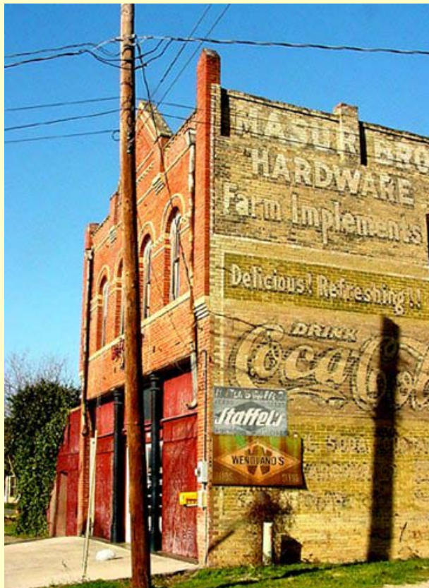
Faded advertising off the square.