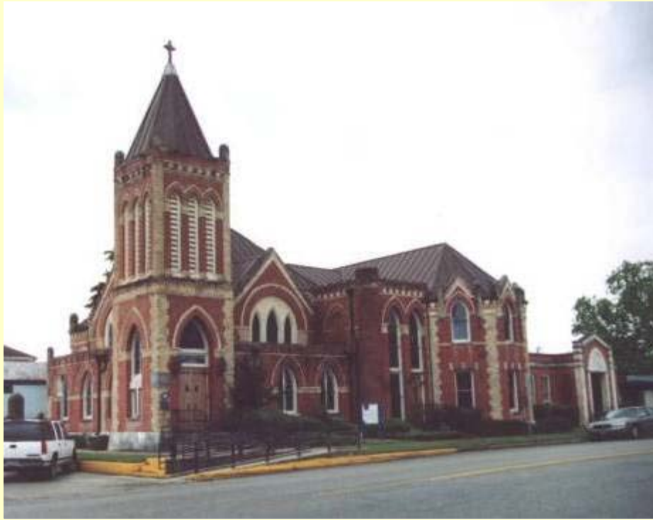
First Christian Church Photo courtesy Barclay Gibson , April 2005