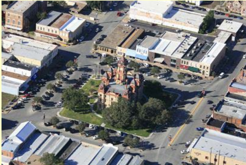
Lockhart aerial photo courtesy of Paul Turner

Caldwell County Seat, Central Texas South Hwy 183 30 miles S of Austin 17 miles N of Luling 18 miles E of San Marcos 34 miles NE of NewBraunfels 28 miles SW of Bastrop 30 miles NW of Gonzales Population: 11,615 (2000)