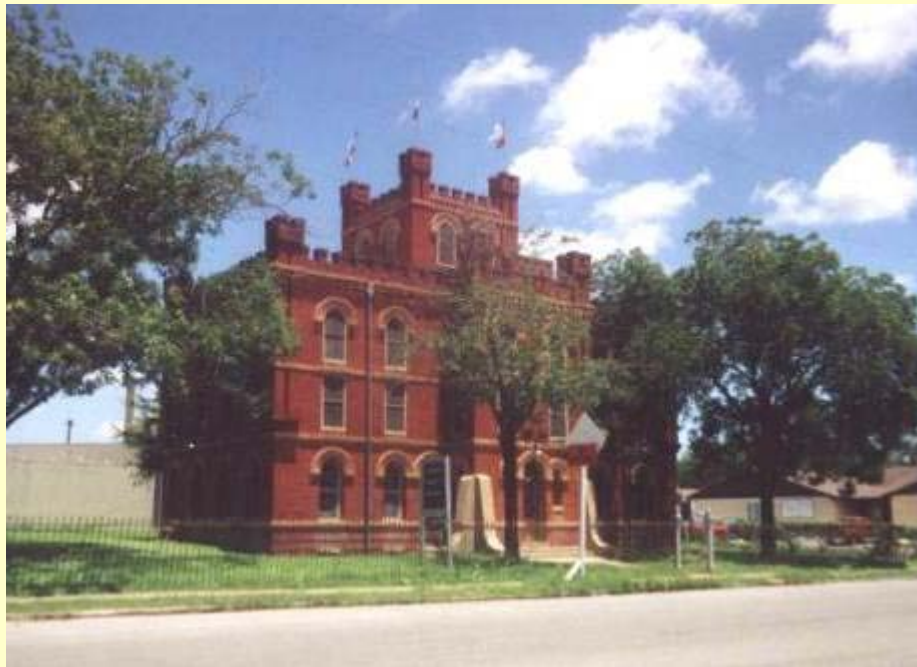
Caldwell County Museum, former Caldwell County Jail Photo courtesy Barclay Gibson , October, 2003

Antique stores are opened weekends as well.