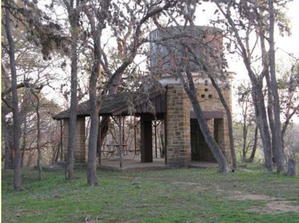
Lockhart State Park. March 2008