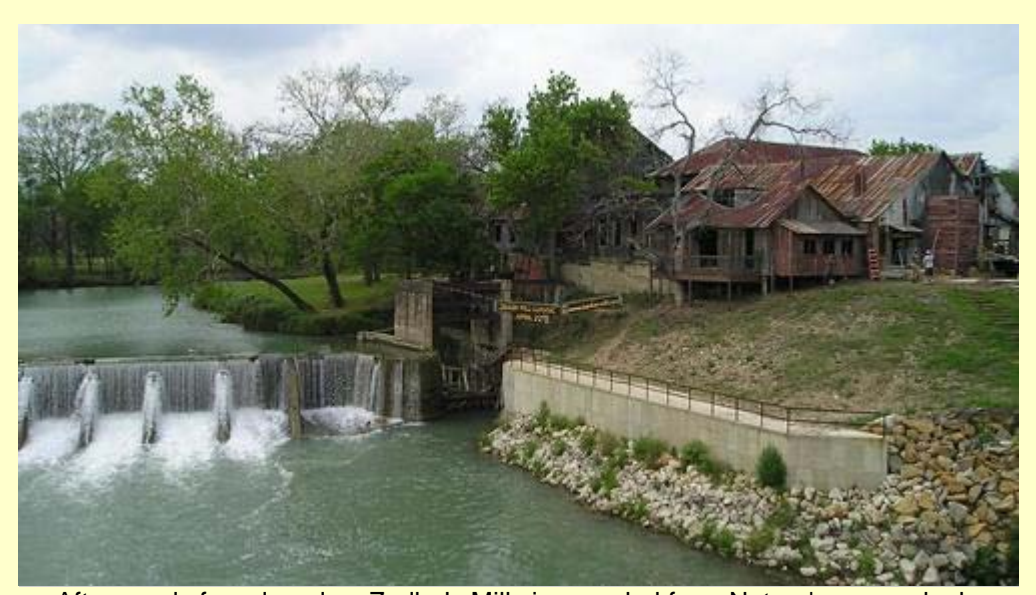
After nearly four decades, Zedler's Mills is revealed from Nature's green cloak. Photo Courtesy Sarah Reveley, March 2006