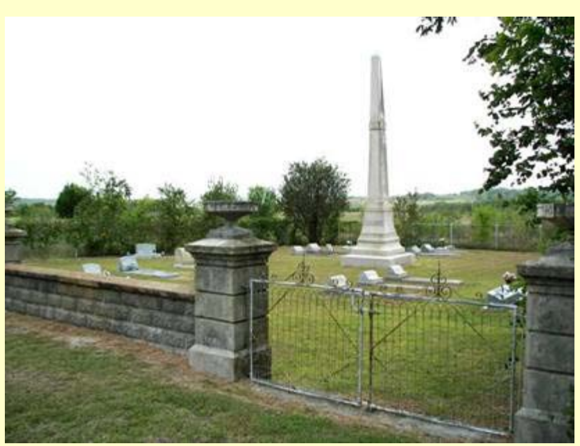
Schawe Cemetery Photo courtesy <u>Barclay Gibson</u>, August 2006