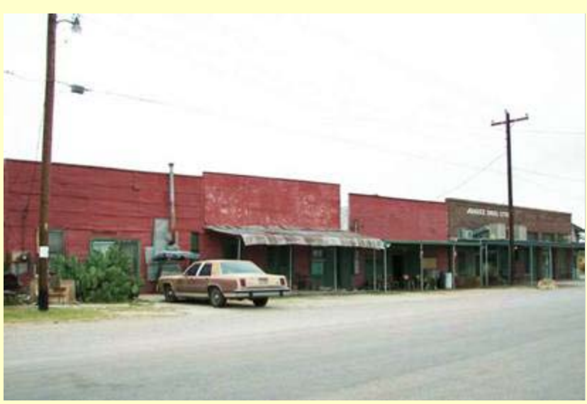
Downtown Maxwell August 2006