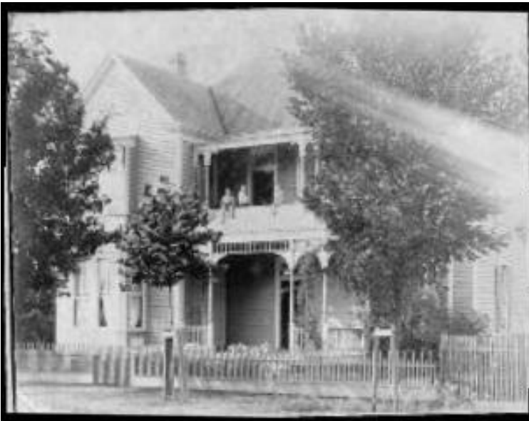
McCurdy Home at 305 Prairie Street. (Circa 1903)